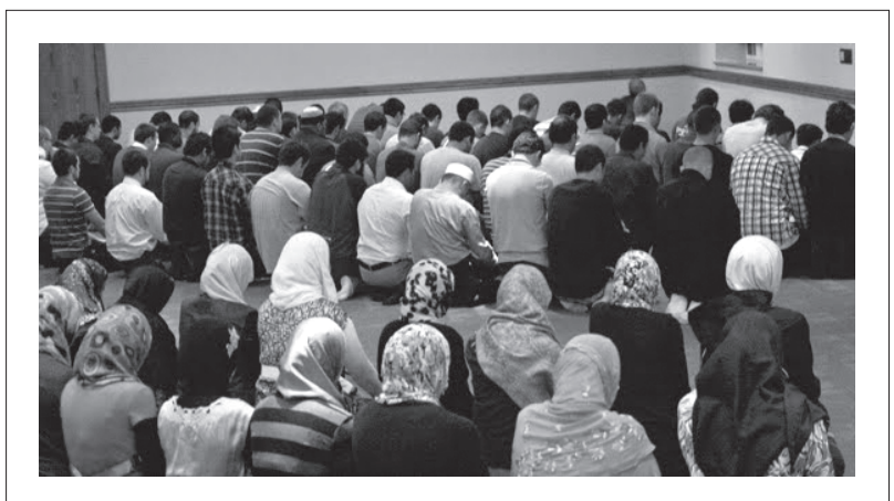
A comprehensive study of the relationship between Shari'a adherence and incitement to violence in American mosques found that mosques that segregated men from women during prayer service were more likely to contain violence-positive materials than those where men and women were not segregated.

The survey found a strong correlation between the presence of severe violence-promoting literature and mosques featuring written, audio, and video materials that actually promoted such acts. By promotion of jihad, the study included literature encouraging worshipers to engage in terrorist activity, to provide financial support to jihadists, and to promote the establishment of a caliphate in the