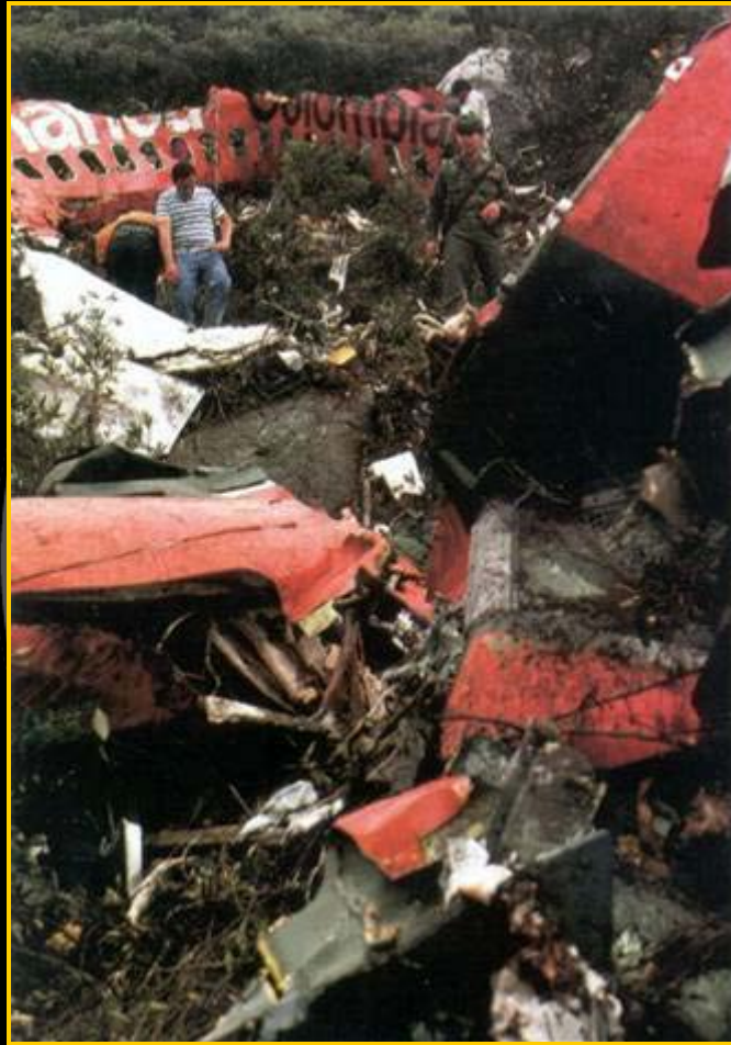
Avianca bombing 11/27/89 110 dead