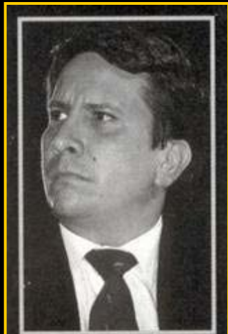
Rodrigo Lara Bonilla (1946-1984) Ministro de Justicia